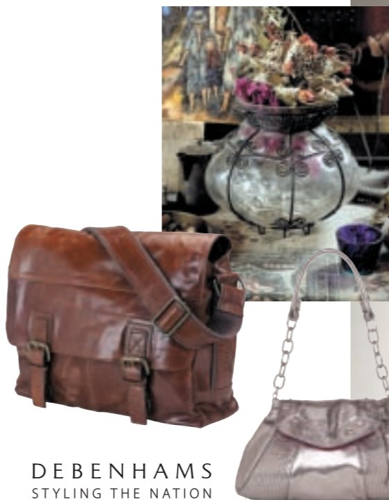
DEBENHAMS STYLING THE NATION