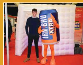
Irn Bru Can Man