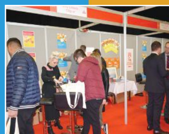
Chip in Stand