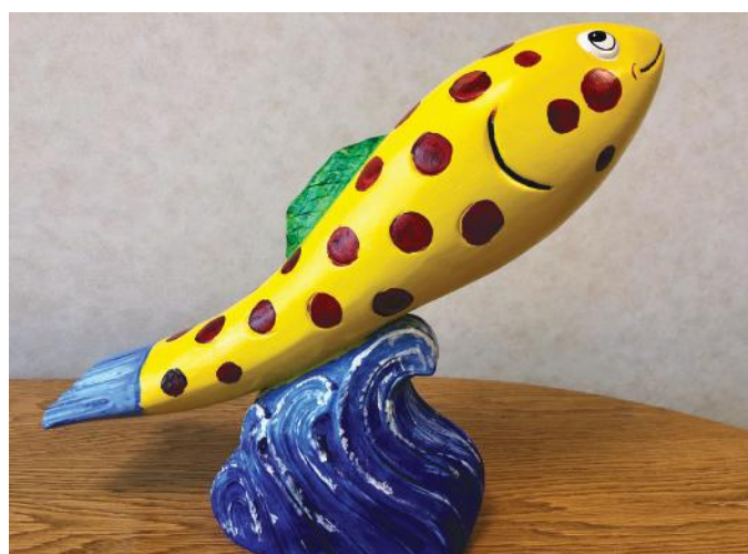
Alan Titchmarsh's Green (Fin)gered Greater Spotted Gardner Fish!

Almost 100 artists and celebrities have agreed to paint or adorn a fish, glaze it and then return it to the Fishermen's Mission HQ. Each completed fish will be individually photographed and displayed on a special auction page on The Fishermen's Mission website.