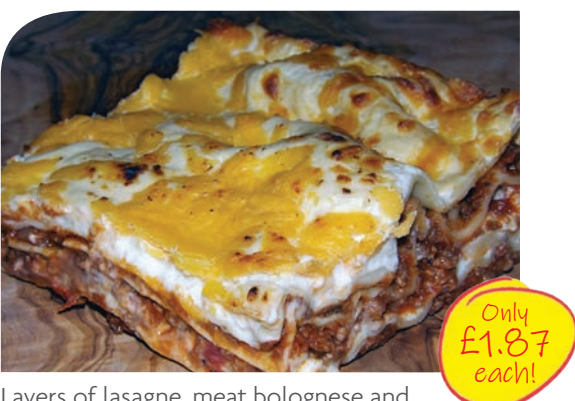
Layers of lasagne, meat bolognese and béchamel sauce topped with grated cheese.