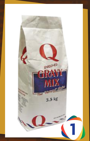
Q GRAMY MIX