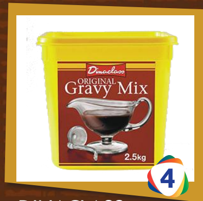
DINACLASS GRAVY MIX