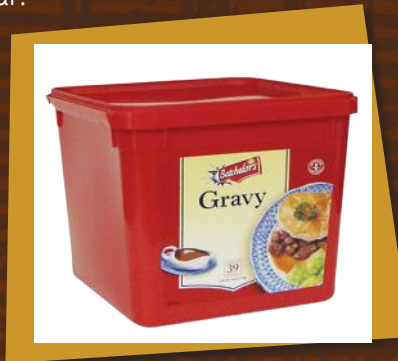
BATCHELORS GRAVY MIX ✓