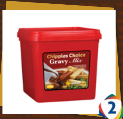
CHIPPIES CHOICE GRAVY MIX ✓

Snap up some hot deals on our quick and easy to make gravy mixes, gravy browning and serving equipment and you'll be riding the gravy train all the way into the New Year!