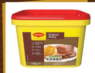
MAGGI GRAVY MIX