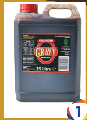
HALLAMSHIRE GRAVY BROWNING ✓