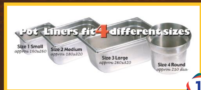
BAIN MARIE BAGS