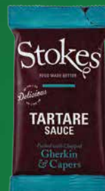
STOKES TARTARE SACHET