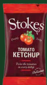
STOKES TOMATO SACHET

Also... available in Brown Sauce & Mayo too!