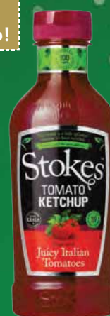
NEW REAL STOKES TOMATO KETCHUP