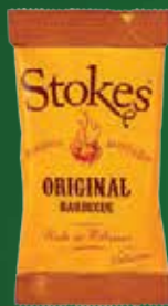
STOKES BBQ SACHET