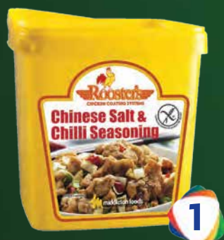
ROOSTERS SALT & CHILLI SEASONING