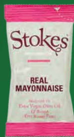
STOKES MAYONNAISE SACHET