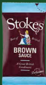
STOKES BROWN SACHET