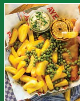
AYE AYE 9/16" CHIPS