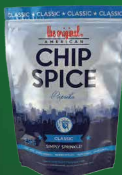
AMERICAN CHIP SPICE