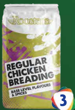
ROOSTERS REGULAR BREADING