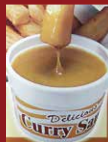
GOLDFISH CURRY DIP