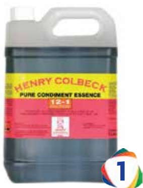
COLBECK COND ESSENCE (12-1) VINEGAR