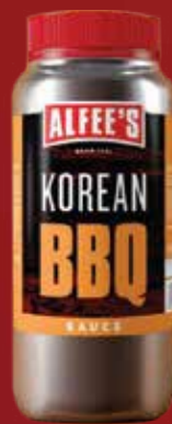
ALFEE'S KOREAN BBQ SAUCE