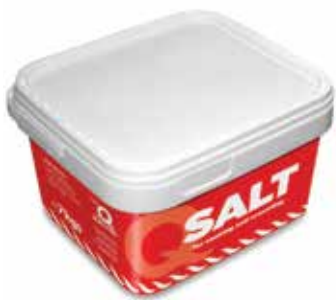
Q TABLE SALT (TUB)

From value-driven options to trusted favourites, our range gives you quality, consistency, and great pricing on the products you use every single day.