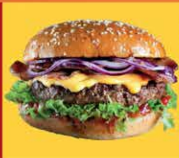
PRIME BURGER 40 x 150g Code 890099