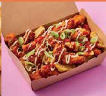
CRISPY SHREDDED CHICKEN 1kg Code 890107