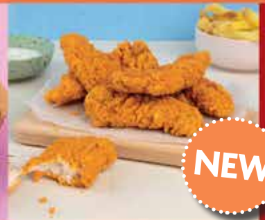
HOT N SPICY CHICKEN STRIPS 1kg Code 890125