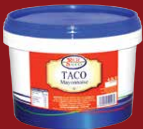
RICH SAUCES TACO MAYONNAISE