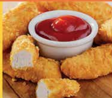
BATTERED CHICKEN GOUJON 1kg Code 890110