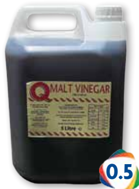
Q BRAND BROWN MALT VINEGAR