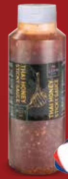
LION THAI STICKY HONEY SAUCE