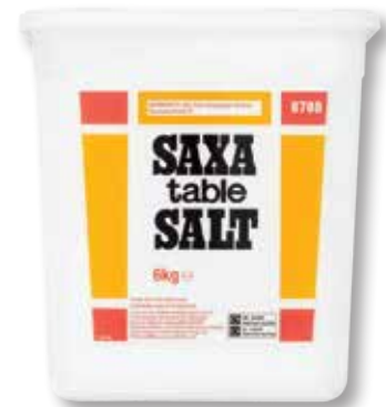
SAXA TABLE SALT (8788)