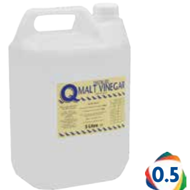
Q/HALLAMSHIRE DISTILLED CLEAR VINEGAR