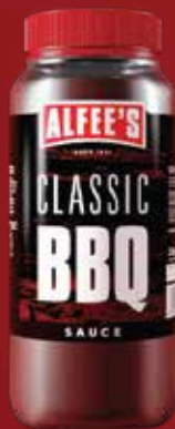
ALFEE'S CLASSIC BBQ