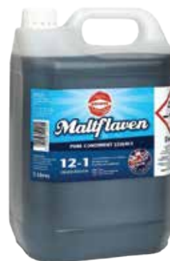
MALTFLAVEN COND ESSENCE (12-1) VINEGAR