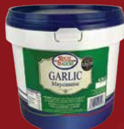
RICH SAUCES GARLIC MAYONNAISE