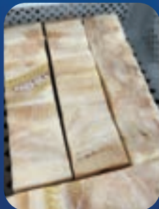
Cut 'sticks' from the block (still frozen).