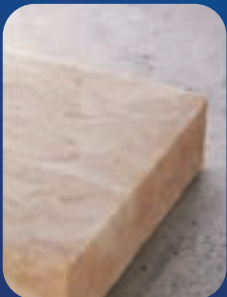
Then we create a high quality frozen at sea fillet block.

Defrost your SeaWorthy Pollock pieces. Dry the fish to help the seasonings stick – then coat with a seasoning of your choice. Batter, fry & serve – delicious!