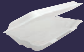
IP1 LARGE BOX (RECYCLABLE) WHITE