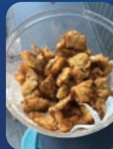
The nugs are floured battered and deep fried.