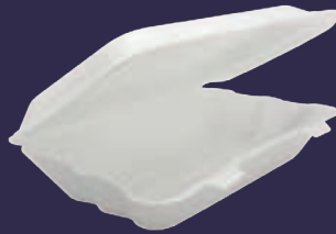
IP3 MED BOX (RECYCLABLE) WHITE