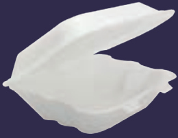
IP2 SMALL BOX (RECYCLABLE) WHITE