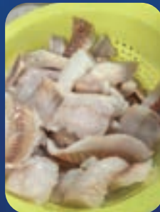
Then you defrost the number of 'sticks' you need each day - nugs will separate from the stick perfectly.